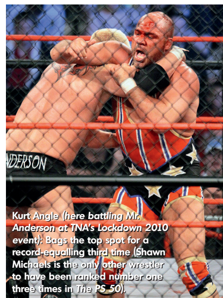
Kurt Angle (here battling Mr. Anderson at TNA's Lockdown 2010 event): Bags the top spot for a record-equaling third time (Shawn Michaels is the only other wrestler to have been ranked number one three times in The PS 50 ).

4 PRINCE DEVITT (NJPW; LAST YEAR PLACED: 33) Huge climber on The PS 50 chart rose to the top of his division in a logical progression from 2009 . . . Runner-up to Naomichi Marufuji in the sterling two-night Super J-Cup 5th Stage tournament from December 22-23 . . . Lost to Marufuji again in an awe-inspiring IWGP title collision on January 30 . . . With Apollo 55 partner Ryusuke Taguchi, retained the IWGP junior heavyweight tag title against Gedo and Dick Togo on February 14 . . . Was sidelined by a meniscus tear in March-April . . . Returned to Japan for the Super J tag team tournament in May, prior to which Apollo 55 had vacated the IWGP junior tag title . . . Best Of The Super Junior runner-up in 2009 went one better in 2010 when he beat Kota Ibushi in a high-flying final on June 13 . . . Finally beat Marufuji for the IWGP gold in a killer 20:20 bout on June 19 . . . In his first defence on July 11, retained the belt against Atsushi Aoki in an exceptional Korakuen Hall main event . . . Replaced an injured Marufuji in the G1 Climax, and entered many stature-enhancing performances . . . Matches in October and November with Taguchi against Golden Lovers Kenny Omega and Kota Ibushi were outstanding.